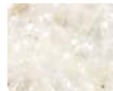
Tambora VE01 [12 mm]