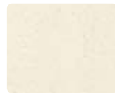
Crystal Beige G101 [12 mm]