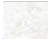
Arctic Granite G34 [12/9/6 mm]